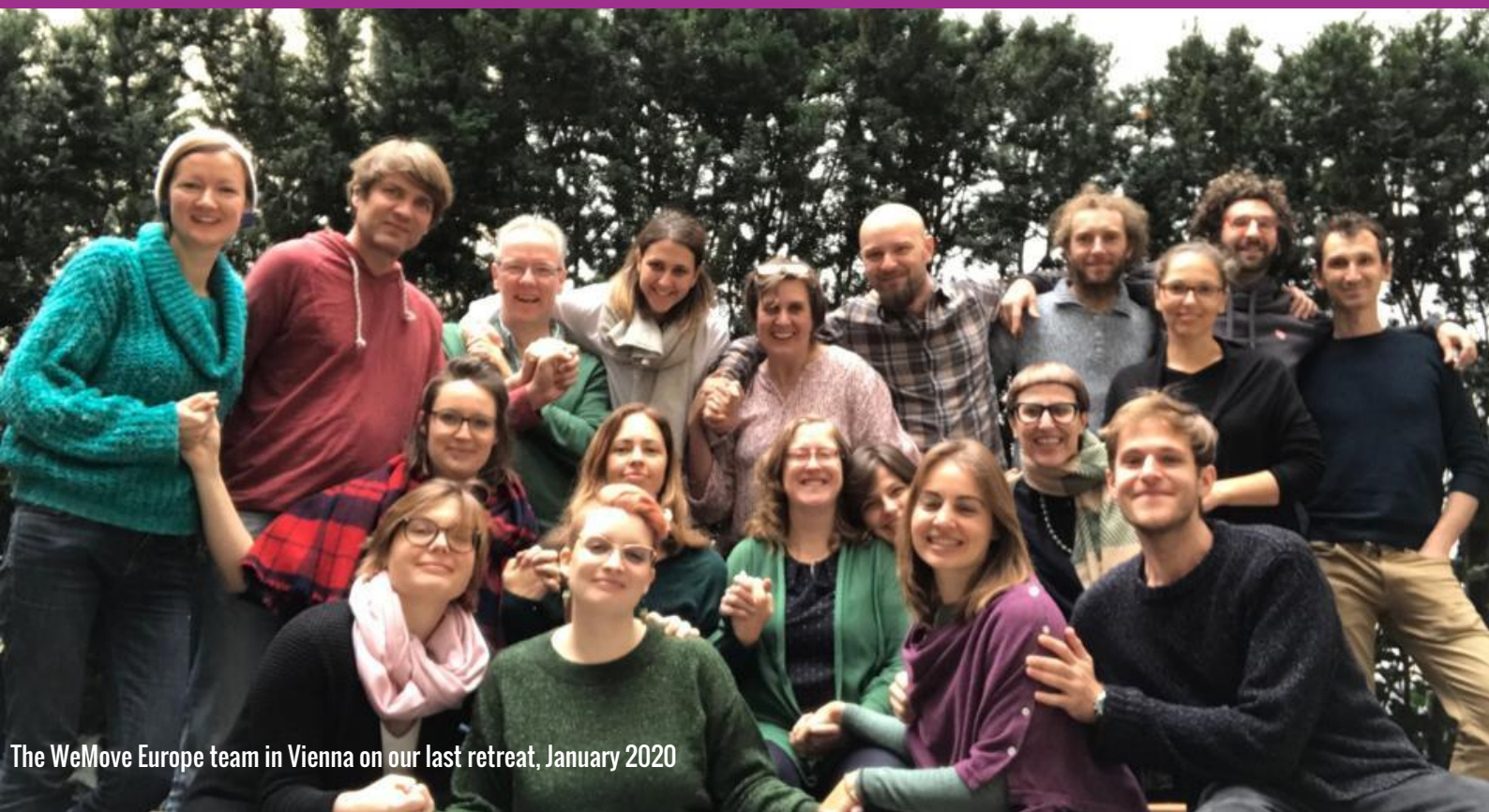
The WeMove Europe team in Vienna on our last retreat, January 2020

See our latest campaigns and take action at WeMove.eu/our-campaigns